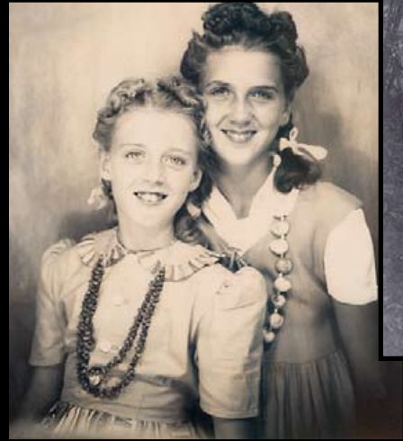
sisters, brother, cousin, the clan